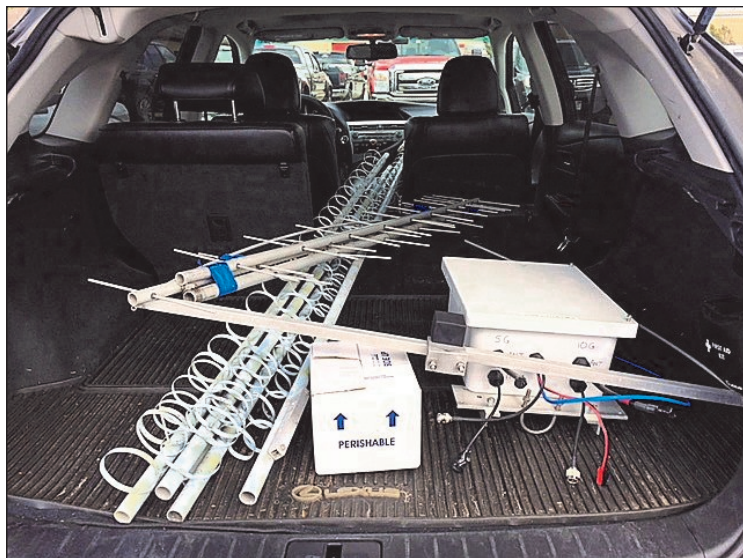
I filled my trunk with aluminum and the 5&10GHz box for K3IPM.